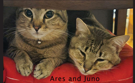
Ares and Juno

NO PANDEMIC PANDEMONIUM FOR BCCC...we carried on